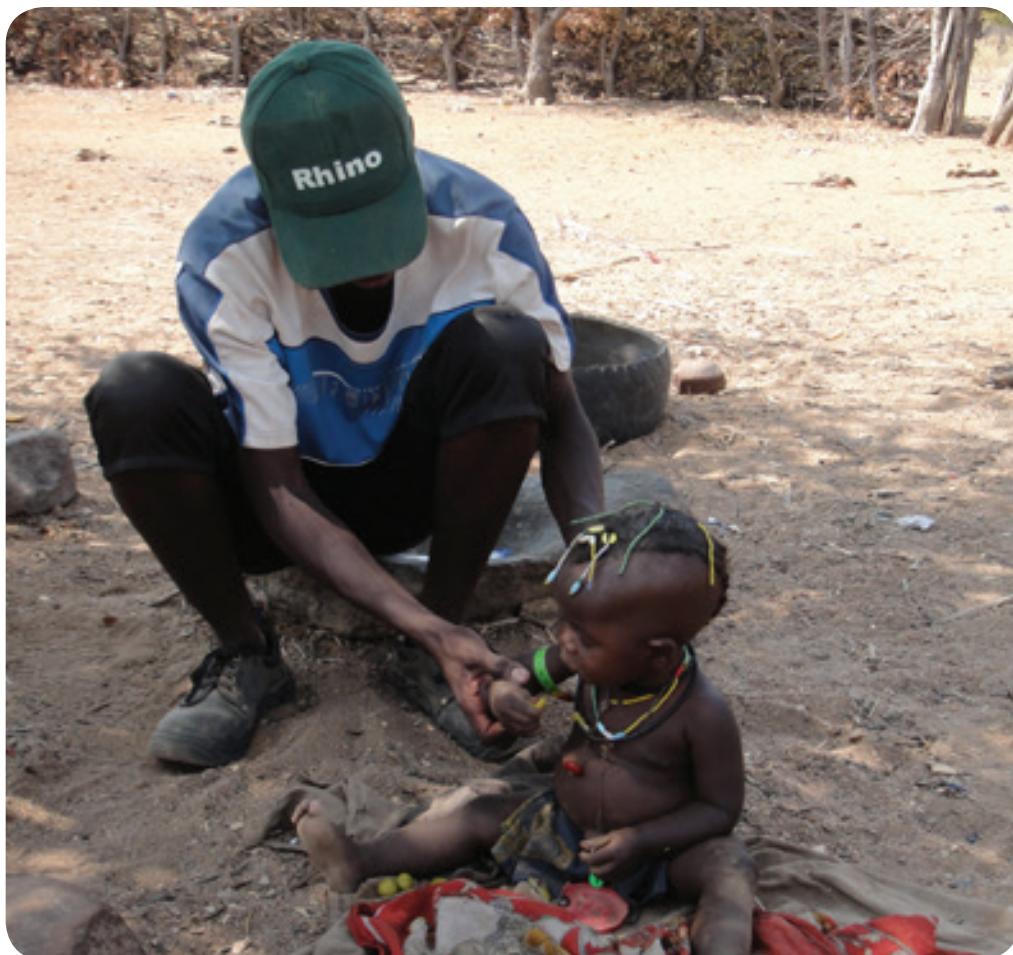
A Health Extension Worker, trained through funding by Teck, measures the arm of a child in Oshana, Namibia to assess the level of malnutrition.

I have a unique position working at Red Dog. I see the daily mining operations and shipment of zinc. I look forward to continuing to understand the impact we have from a remote camp above the Arctic Circle to making people's lives better.