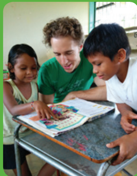
Craig Kielburger reads with two children in Chimborazo, Ecuador.

empowerment event that encourages students to take action on local and global issues to make the world a better place. Teck has educated more than 200,000 youth leaders about Zinc & Health through a range of engaging We Day campaigns.