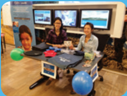
Calgary Stampede Breakfast volunteers at the Zinc & Health table