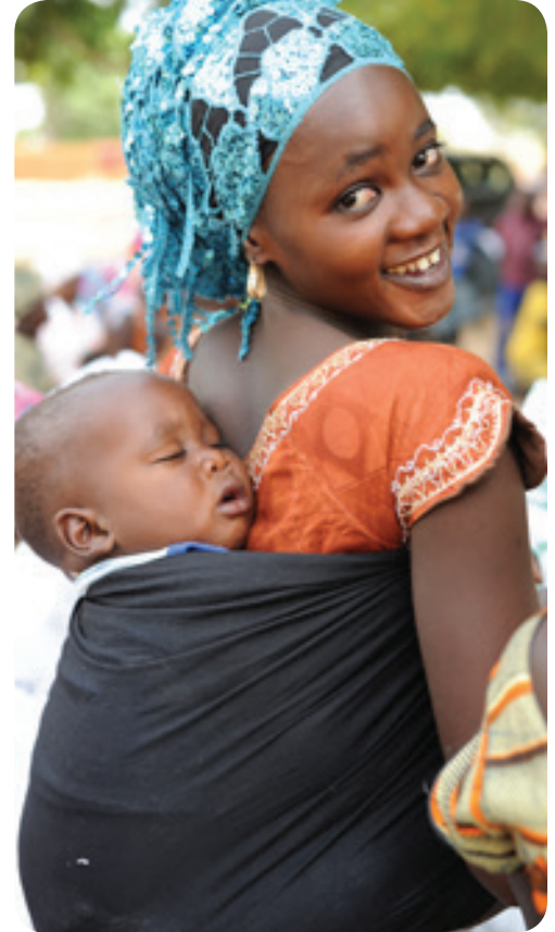
A mother walks with her son in Murang'a County, Kenya.

The ANF4W pilot will expand to Ghana and Bangladesh in 2015.