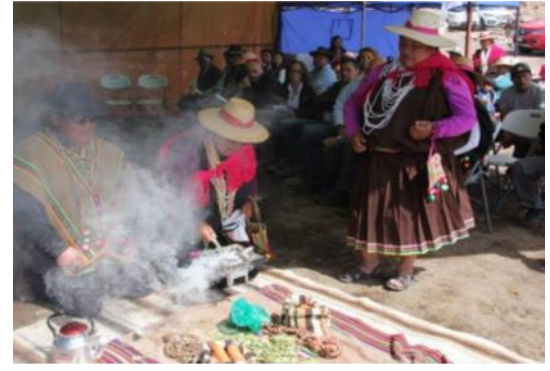
Local Indigenous community