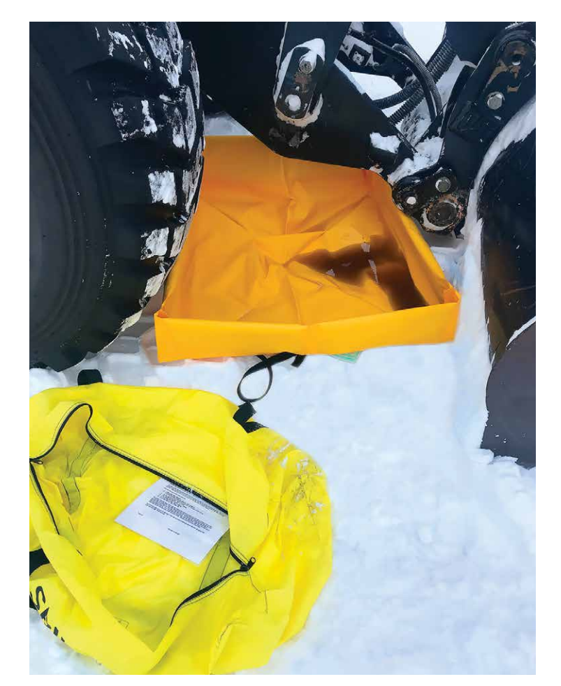
Mobile Spill Response Kits are located in every small vehicle to help prevent or lessen spill impacts.

To date, the Stop the Drop initiative has resulted in proactive maintenance activities preventing a total of 170 spills with the potential of 4867 gallons. This effort also resulted in the addition of mobile spill response kits placed in all light vehicles around the property.