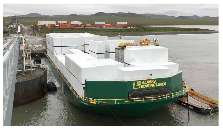
Modules built at NCC's Big Lake facility were delivered by barge to Red Dog.