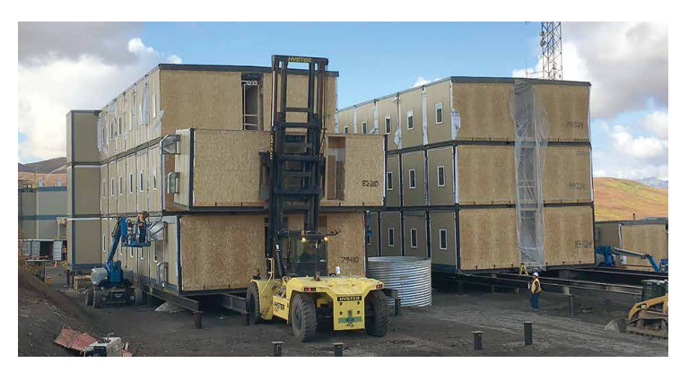
NCC installed the camp modules at Red Dog in the fall 2018.

The modules were installed in the fall. NCC has seen substantial growth and expansion of its' facility and field services divisions. This has been accomplished by focusing on key clients and areas of expertise in mining and oil and gas construction. With the increase in revenue and project opportunities, NCC has also been able to increase opportunities for shareholder hire and development. The company has grown from 45 employees in 2017 to over 300 active employees today.