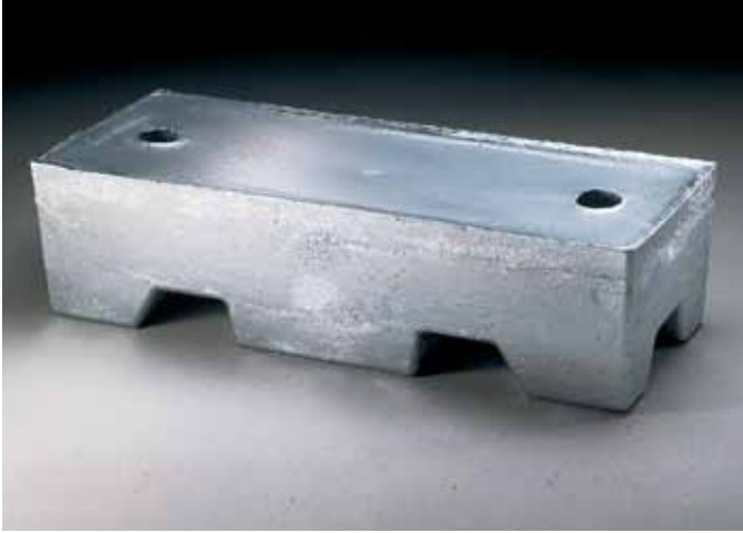
Zinc Strip Jumbo 1089 kg; 2400 lb