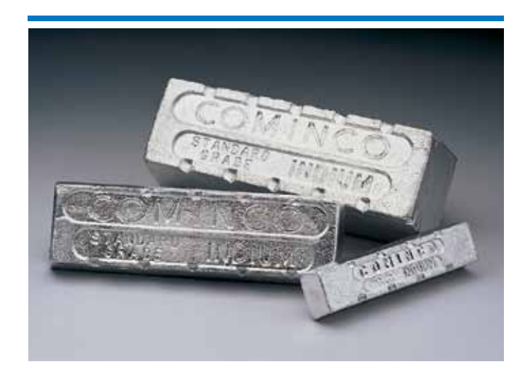
Indium Ingots 1 kg; 3 kg; 10 kg