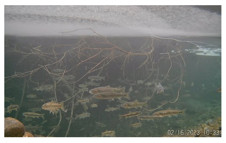
Image: Westslope Cutthroat Trout in an overwintering pond in the Upper Fording River, Feb. 16, 2023.

Teck works with external registered professionals to undertake fish population monitoring. The most recent results show a positive fish population trend in the Upper Fording River, located immediately downstream of Teck's Fording River Operation and Greenhills Operation.