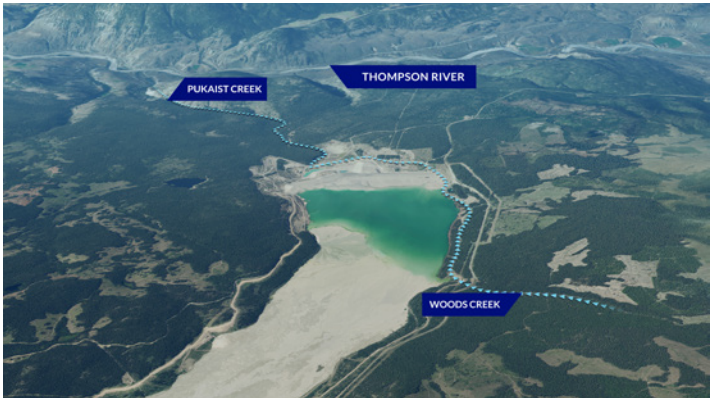
Historical flows from Woods Creek to Pukaist Creek have been reestablished through the installation of the Woods Creek Diversion, enhancing groundwater control for downstream land users and ecosystems.