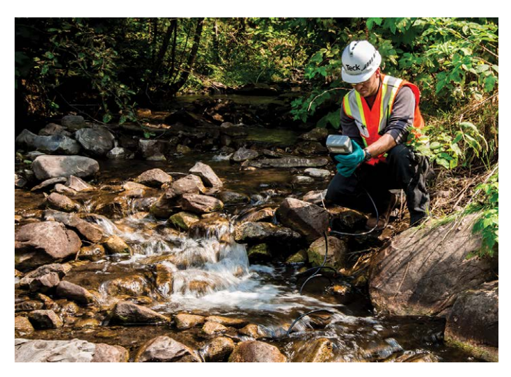
Water quality testing at Thompson Creek

We are conducting extensive monitoring to improve our understanding of water quality and aquatic health. Existing studies show that selenium concentrations and other mine indicators of water quality within the watershed are at levels that have not affected populations of fish and other sensitive aquatic animals.