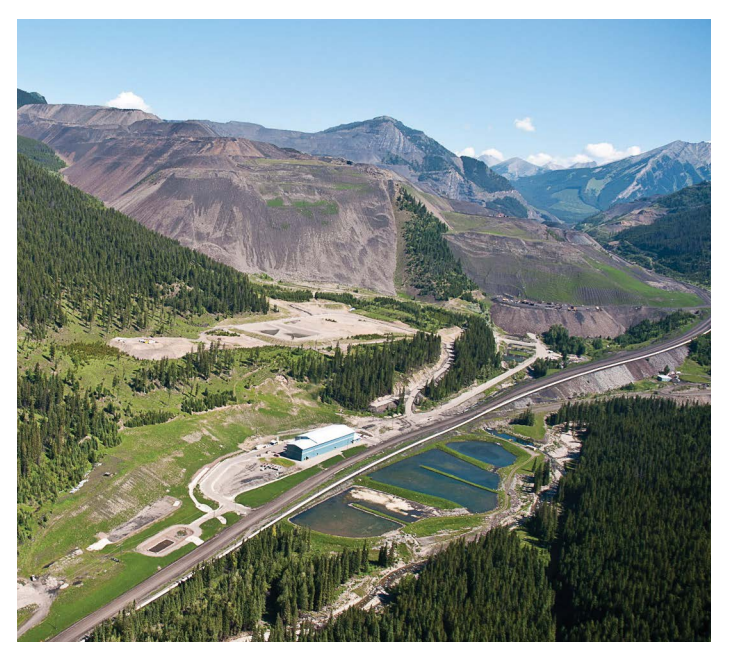
The West Line Creek Active Water Treatment Facility at Line Creek Operations.