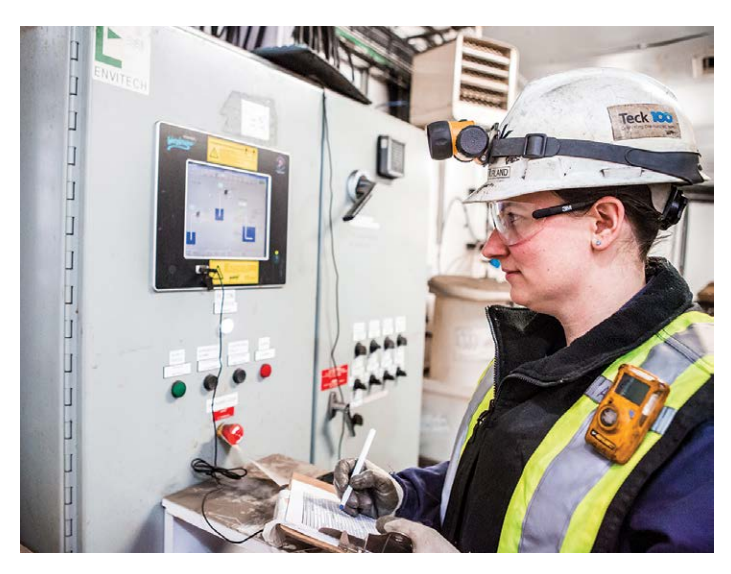
Working at Fording River operations Active Water Treatment pilot project.

We continue to do more research to better understand this potential application, and how it can complement our water treatment approach.