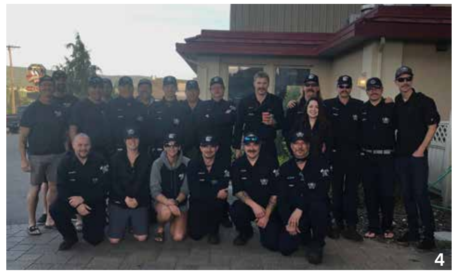
Teams from Highland Valley Copper (1), Line Creek (2), Cardinal River (3), and Fording River (4) pictured here are prepared to tackle any incident. Through tireless practice and training, our teams know the importance of strong mine rescue programs. This year's overwhelming wins are a testament to Teck's preparedness and exemplary safety culture.