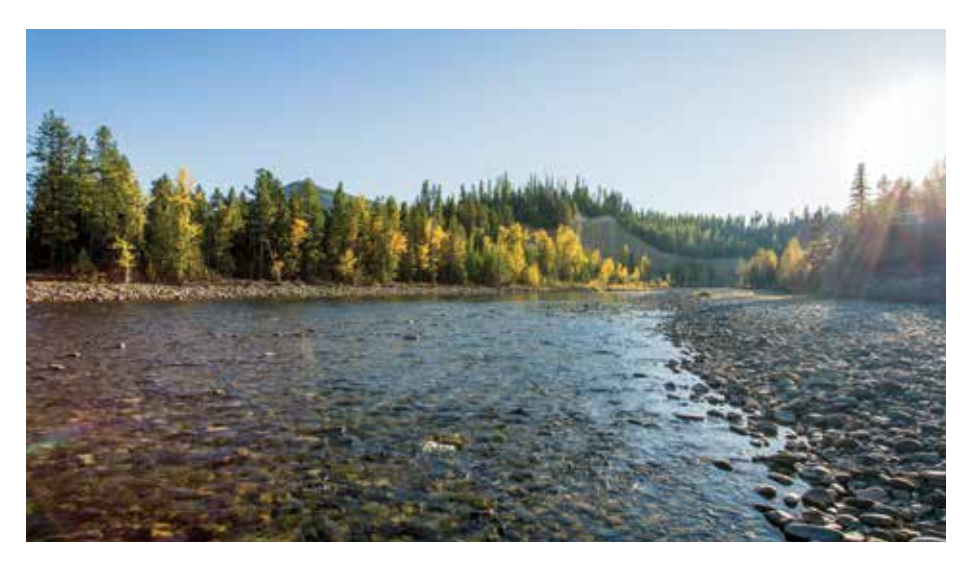
Explained: Teck's breakthrough in water treatment using saturated rock fills. Watch a video about how it's done on YouTube.

We're sharing Teck's stories on social media. Visit us online to find these and more