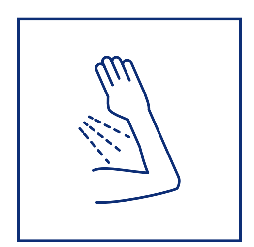
Cover your mouth with a tissue or your sleeve (not your hands) when you cough or sneeze.