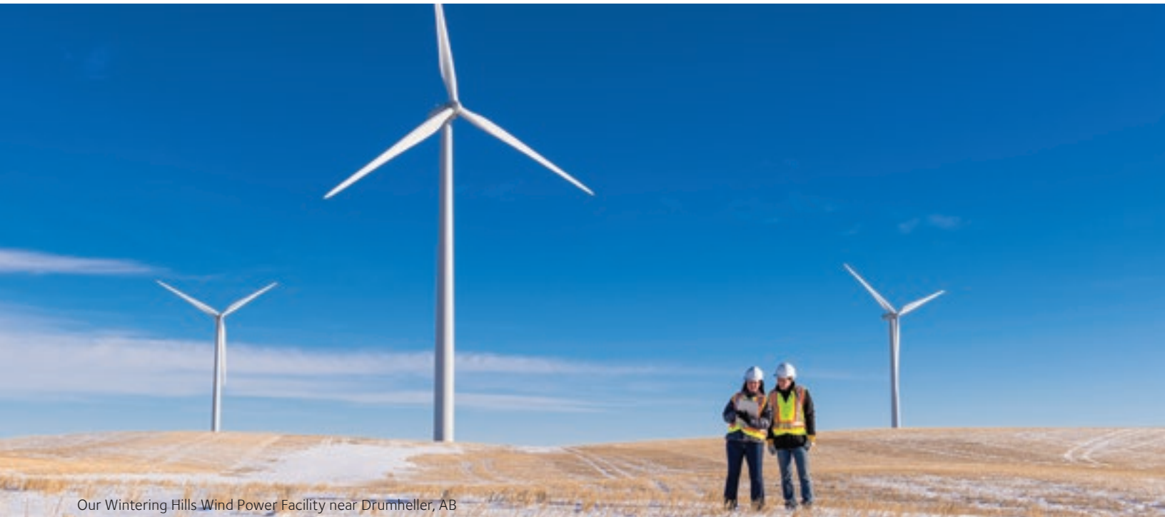
Our Wintering Hills Wind Power Facility near Drumheller, AB

We are a proud founding member of Canada's Oil Sands Innovation Alliance (COSIA); an alliance of oil sands producers focused on accelerating the pace of environmental performance in the oil sands in four Environmental Priority Areas—tailings, water, land, and greenhouse gases.