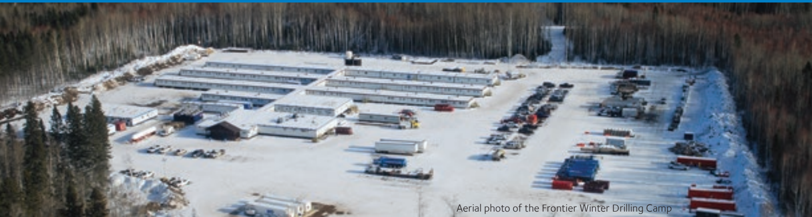
Aerial photo of the Frontier Winter Drilling Camp