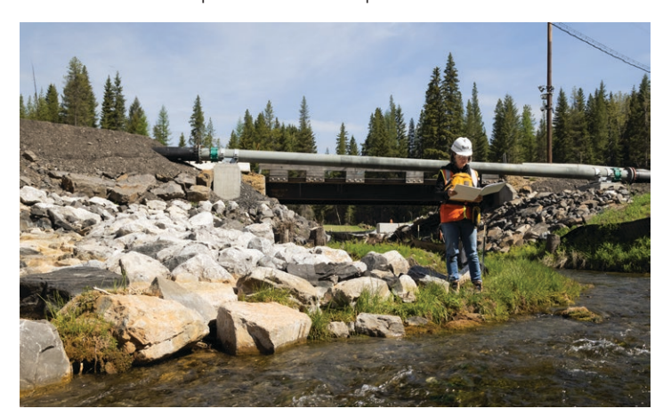
Image: Teck does extensive studies and monitoring of water quality and aquatic health, including regular water quality sampling at locations across the Elk Valley.

Teck is required to monitor at over 150 water quality locations and over 100 biological monitoring stations in the Elk Valley and within the Koocanasa Reservoir. The purpose of this monitoring is to evaluate water quality and to allow for the early detection of emerging water quality concerns. Monitoring results are used to inform management decisions for the protection of aquatic and human health.