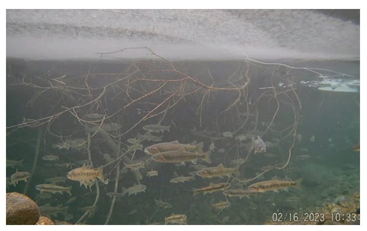
Image: Westslope Cutthroat Trout in an overwintering pond in the Upper Fording River, Feb. 16, 2023.

Teck works with external registered professionals to undertake fish population monitoring. The most recent results show a positive fish population trend in the Upper Fording River, located immediately downstream of Teck's Fording River Operation and Greenhills Operation.