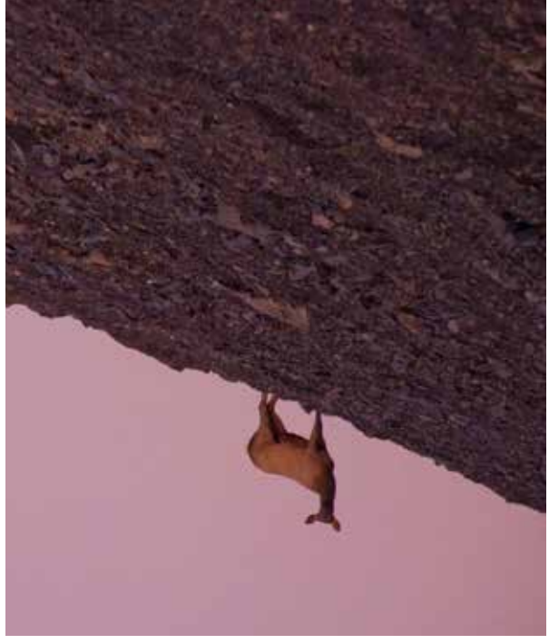
Printed August 2023