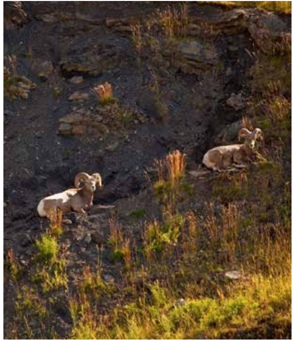
Printed August 2023