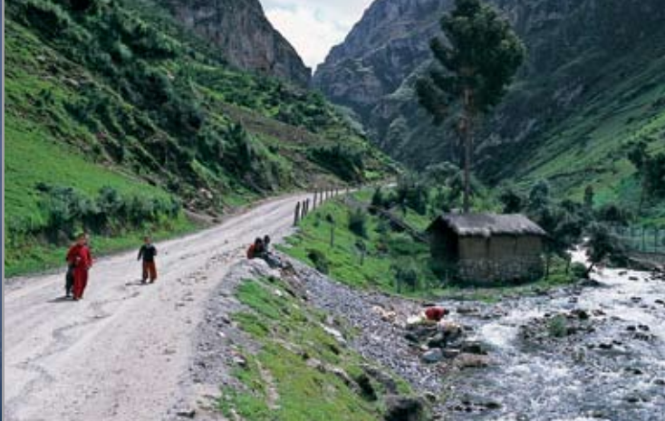
The community of Ayash Pichiu on the Ayash River near the mine.