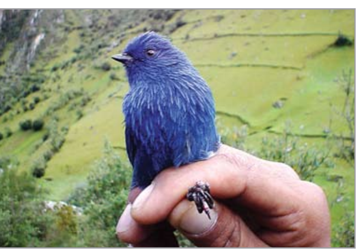
Xenodacnis parina, one of the highland bird species that utilize the Polylepsis forests and will benefit from the conservation area